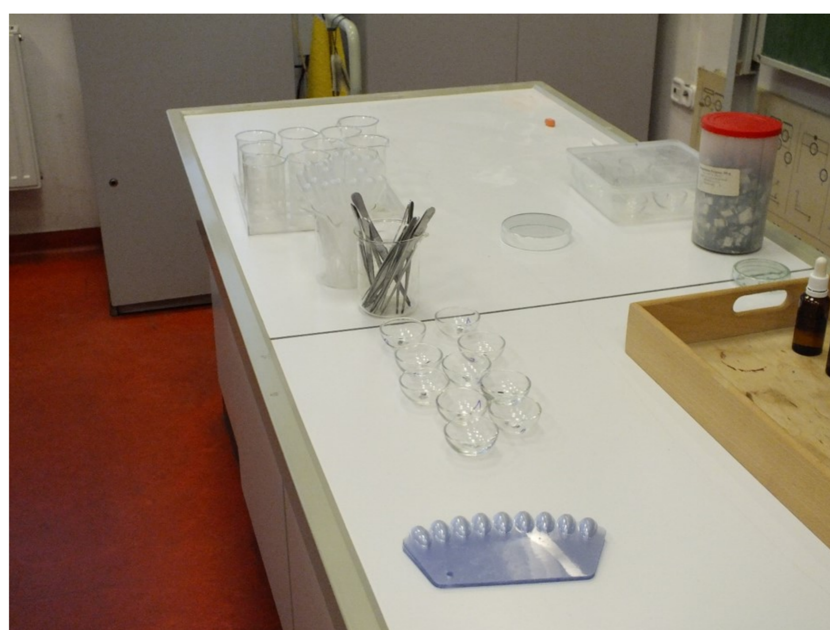
...but it is used as a tool now!