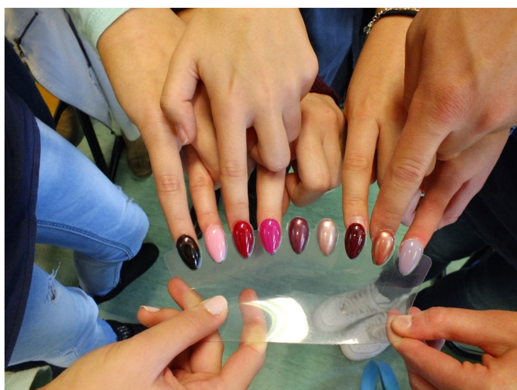
Originally it is not for experiments...